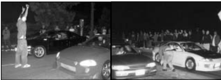
Race starters and observers are often positioned very close to the racing vehicles, putting themselves at considerable risk of injury.

Today in the United States, the racing tradition replays itself during every weekend in thousands of communities in the nation. The primary difference today is that street races are extraordinarily brazen and elaborately orchestrated functions, involving flaggers; timekeepers; lookouts equipped with computers mounted in their cars, cell phones, police scanners, two-way radios, and walkie-talkies; and websites that announce race locations and even calculate the odds of getting caught by the police. 17 Some websites even provide recaps of the previous night's races, complete with ratings of police presence, crowd size, and a link to the police agency so the curious can see if a warrant has been issued for their arrest. 18