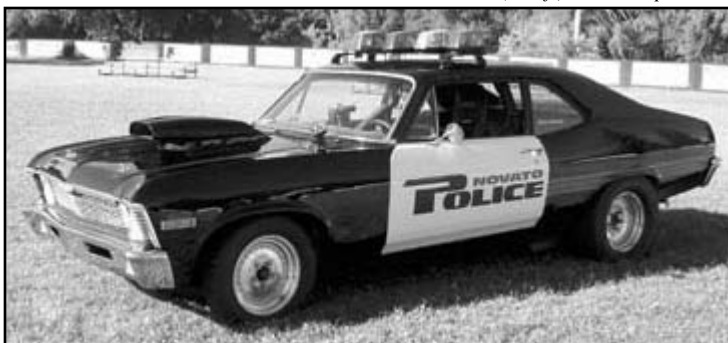
Novato (Calif.) Police Department

Legal, track-based alternatives to street racing are becoming more numerous. Among them is "Project X", a program initiated in 1997 to bridge the gap between police officers and high school aged street racers.