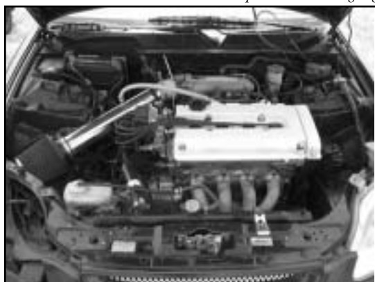
Many street racers spend large amounts of money upgrading their cars' performance.