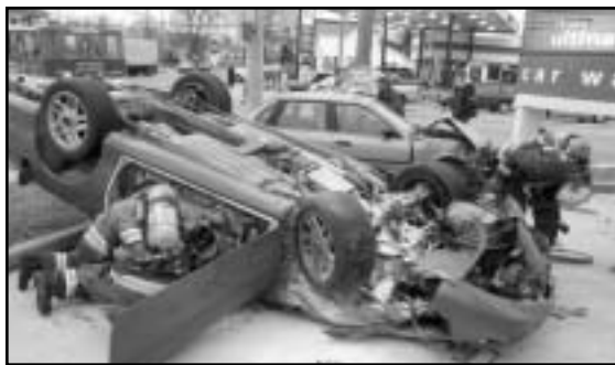
Crashes caused by street racing are often spectacular and cause serious injury and property damage.